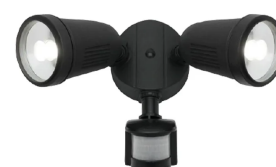
Model No. :MXD6712BLK-SEN Assembly :Black