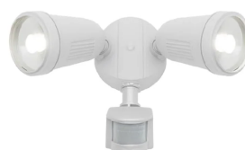
Model No. :MXD6712WHT-SEN Assembly :White