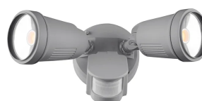
Model No. :MXD6712SIL-SEN Assembly :Silver