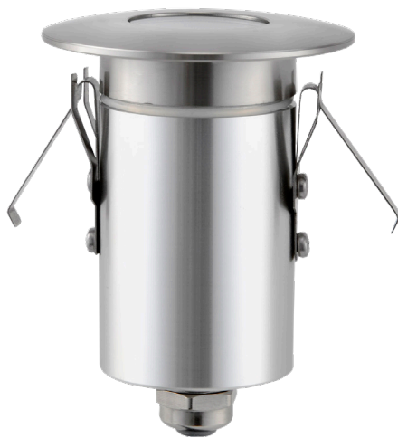
DECK01 & DECK02