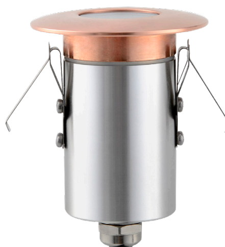
DECK03 & DECK04