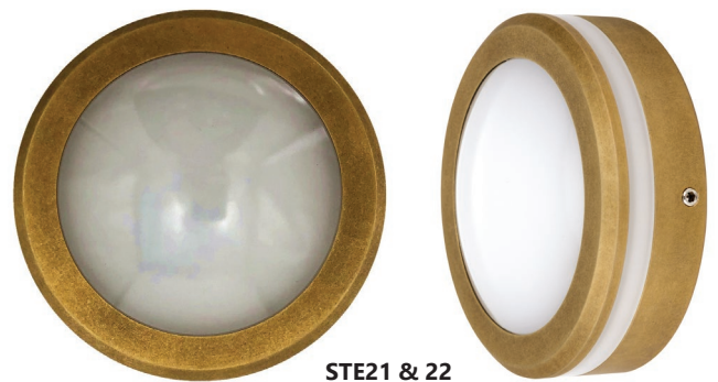
STE21 & 22