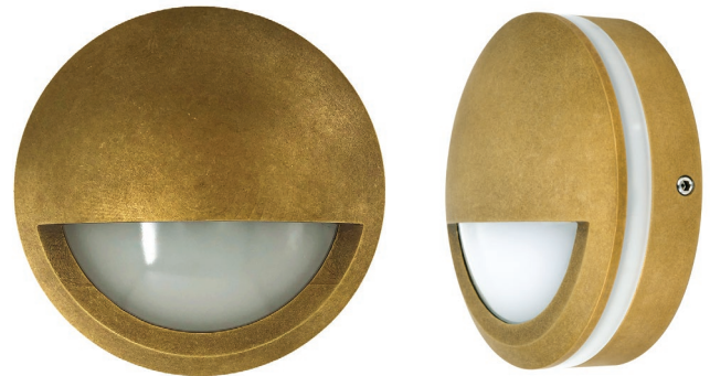
STE19 & 20