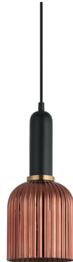
VINTAJ10 (Copper Painted Glass)