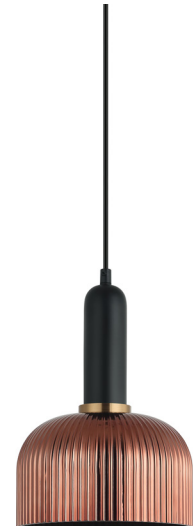
VINTAJ16 (Copper Painted Glass)