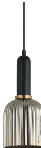
VINTAJ11 (Chrome Glass)