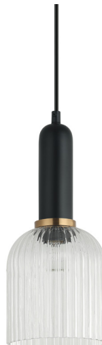
VINTAJ12 (Clear Glass)