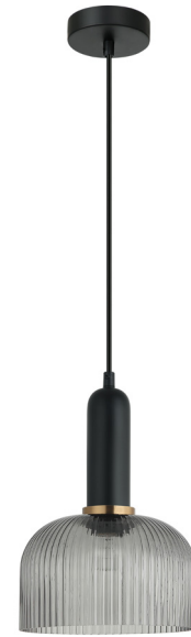
VINTAJ13 (Smokey Black Glass)