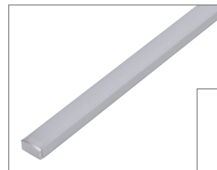
Brushed Aluminium Finish

*** Special powder coat finishes upon request. Surcharges apply.