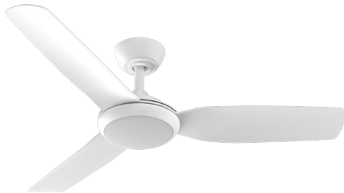
1220mm (48") Model