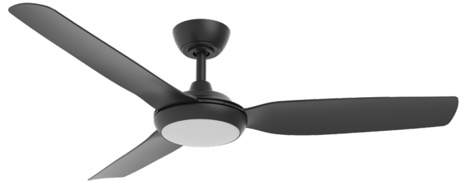
1320mm (52") Model